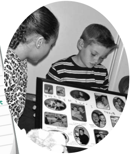
A group member talks about his dad by showing a picture collage brought from home