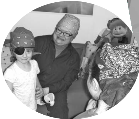
Younger children especially like dramatic play

Dear Friends, You can learn a lot about people that died with friends old and new. There's a lot of crafts that we do at Nello's. We have circle time where we tell about our feelings and we help each other. At first, you're nervous, but then it ends up being good and fun. It can be sad, but then we can be happy. We learn we can talk it through and get through it easier. You are not allowed to talk about what others say. That makes us feel safe. We meet others that have lost a loved one. From your friends at Nello's Corner