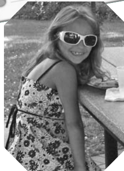
Our annual family picnic offers Nello's Corner participants and their guests a chance to come together during the summer months, catch up with each other, and make connections with other families in the program. This year's picnic was held at Fischer's Park in Lansdale and included a memorial candle lighting.