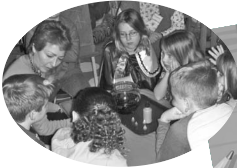
A grief activity using food coloring and bleach helps children talk about their feelings

Nello's Corner is a bereavement support program for children who have experienced the death of an immediate family member. The program also includes an adult component offering support to those actively caring for the grieving child. One of the groups, ages 6-8, wrote this letter to future Nello's kids, explaining what Nello's Corner is all about: