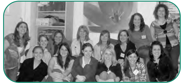
Congratulations to our Volunteer Class of Spring, 2010!